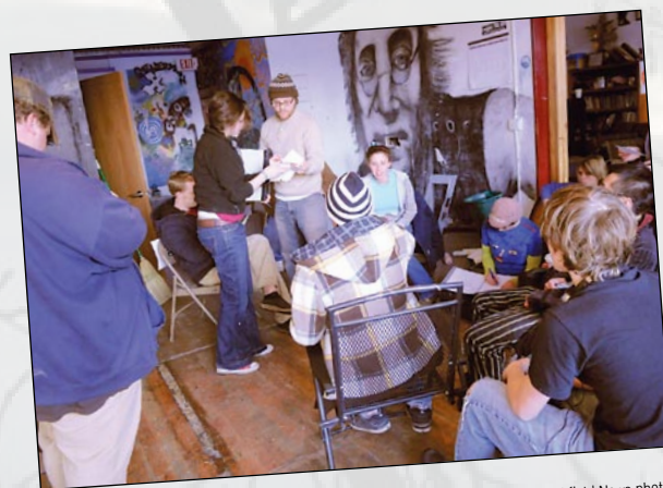
Staff and members of the Northfield Union of Youth sit down for a board meeting on Wednesday afternoon in preparation for the Union's 15th anniversary open house.