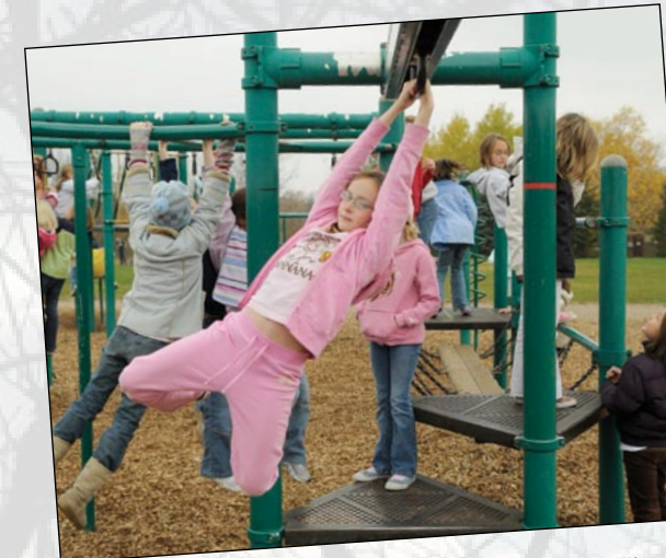
Students at Sibley Elementary School make use of the playground equipment during recess.