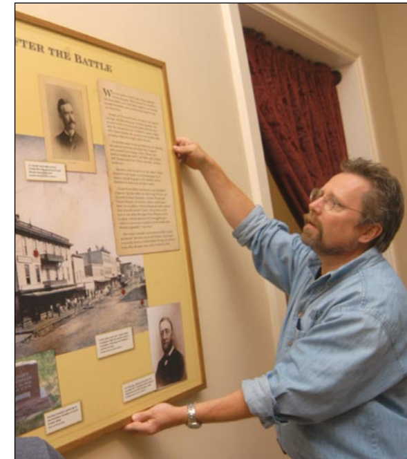
The Northfield Area Foundation helps the Northfield Historical Society with various projects through grant money.